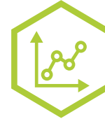
Improve Feed Efficiency